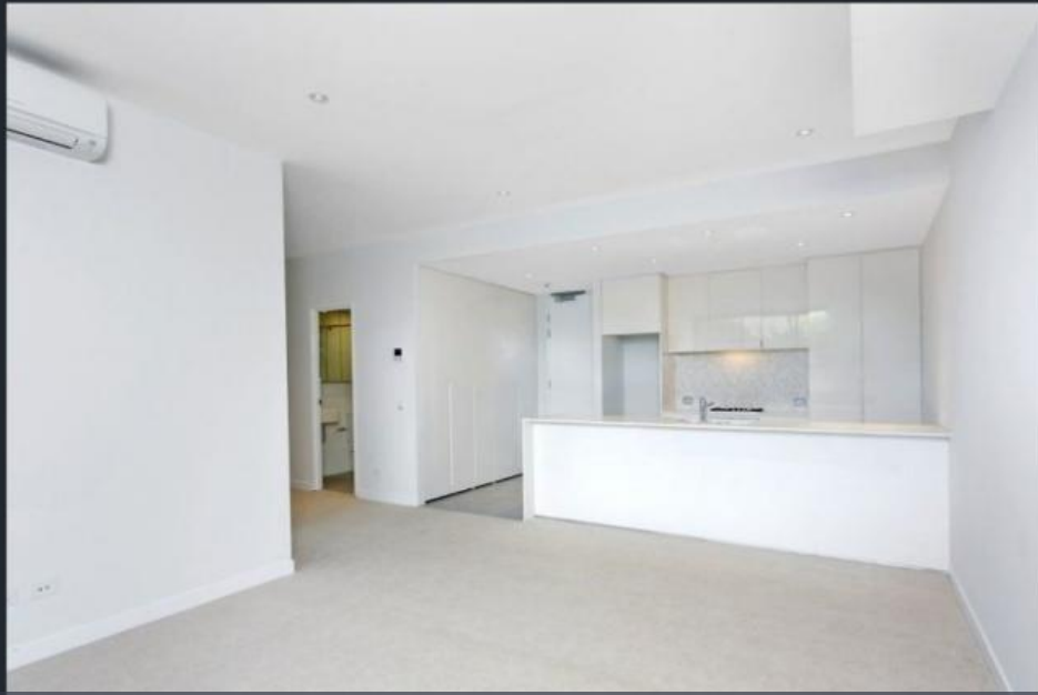
Unit 3, 30 Harvey St, Little Bay