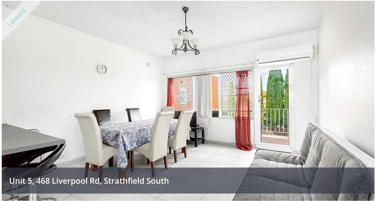
Unit 5, 468 Liverpool Rd, Strathfield South