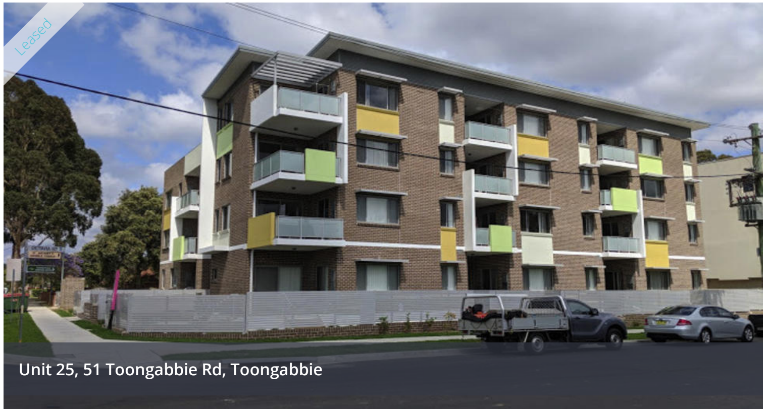
Unit 25, 51 Toongabbie Rd, Toongabbie