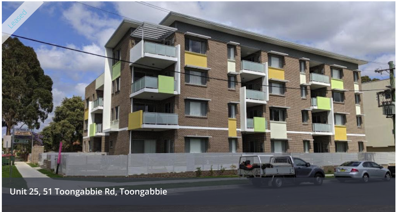
Unit 25, 51 Toongabbie Rd, Toongabbie